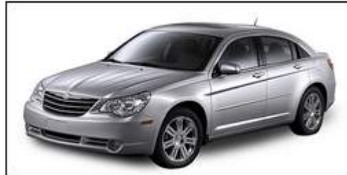
The redesigned Sebring midsize could give Chrysler a needed boost.